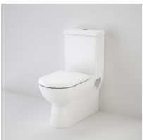
Caroma Metro Wall Faced Toilet Suite