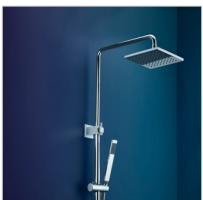
Dorf Jovian Rail Shower