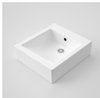
Caroma Liano Above Counter Vanity Basin