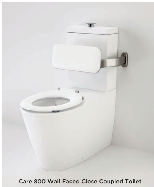
Care 800 Wall Faced Close Coupled Toilet

raised seat height, which makes it easier for those with restricted movement to transfer onto and off the toilet. The architects also specified the Caroma Care 800 Wall Faced Close Coupled Toilet with Backrest. As well as a raised seat height, this toilet has a built-in padded backrest, making it much more comfortable to use. The backrest, as well as the raised pan height and increased pan projection mean that this toilet is compliant with AS 1428.1 Design for access and mobility .