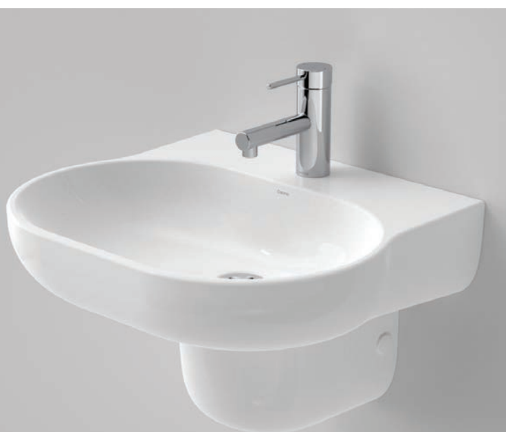
Opal 510 Wall Basin