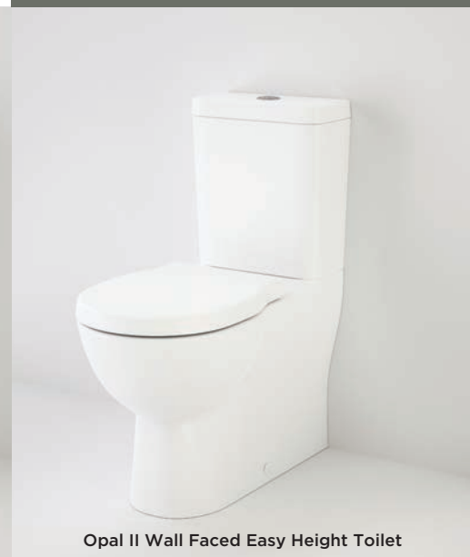
Opal II Wall Faced Easy Height Toilet